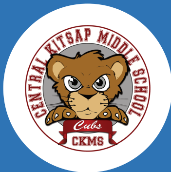
Central Kitsap Middle School